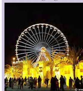
P. 7 Dubai Culture