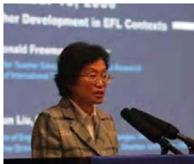
Ms. Wu Qidi, the Vice Minister of the Ministry of Education