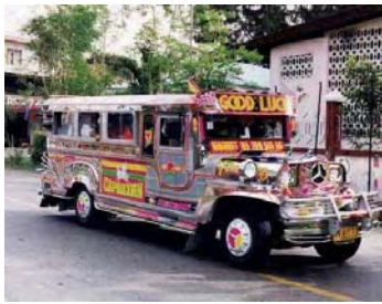
A "Dressed Up" Car