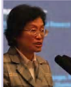
P. 2 The First TESOL Symposium in China