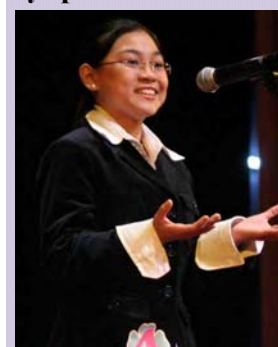
P. 5 Developing Your Speaking Skills