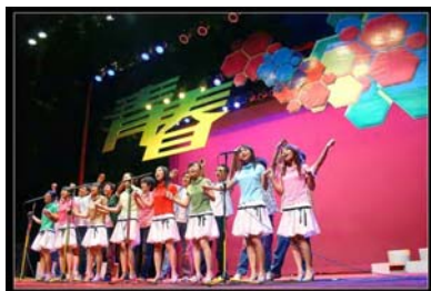
Welcome Performance: Youth