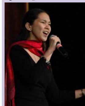
P. 6 Fifth English Festival Highlights