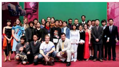
ELC teachers and Speech Contest contestants

In addition to the contests, spectators gathered to watch the interlude talent show, which included the drama of the year, "The Lion King," performed by CEC members, dancing, a piano performance and a Tae Kwon Do performance. This year's festivities won favorable comments