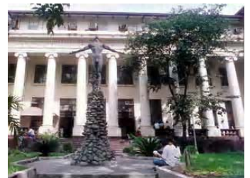
The University of the Philippines in Manila

UP has one autonomous college and six constituents, providing instruction in