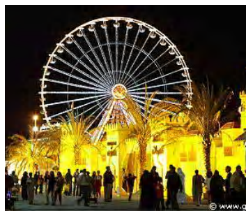
The Dubai Shopping Festival

Dubai culture has interesting specialties in food, manner, patriarchy, and customs, which attract a lot of visitors from around the world. Its rich culture is worthy of our appreciation.