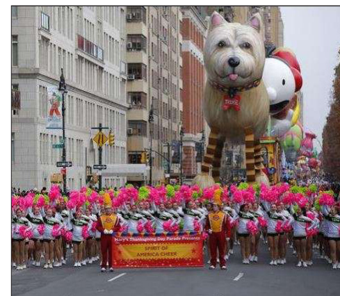
Thanksgiving Day Parade

Performers take part during the 90th annual Macy's Thanksgiving Day Parade on Nov. 24, 2016 in New York.