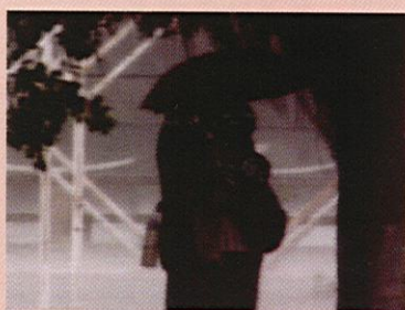
Ground of our basketball court is rough.

What we should do is to get youths to ask this question: Do I have enough sex education? If not, please go to learn more to become more qualified before actually getting involved with sex.