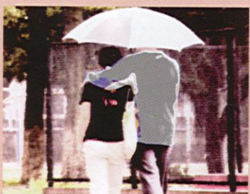
To couples in campus: "Are you ready to be responsible for your behavior if you want to try the forbidden fruit premarital sex?"